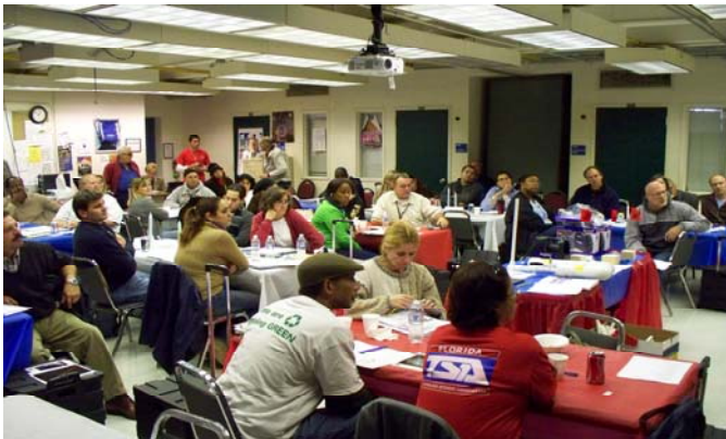
Miami-Dade Teachers absorbing instructions