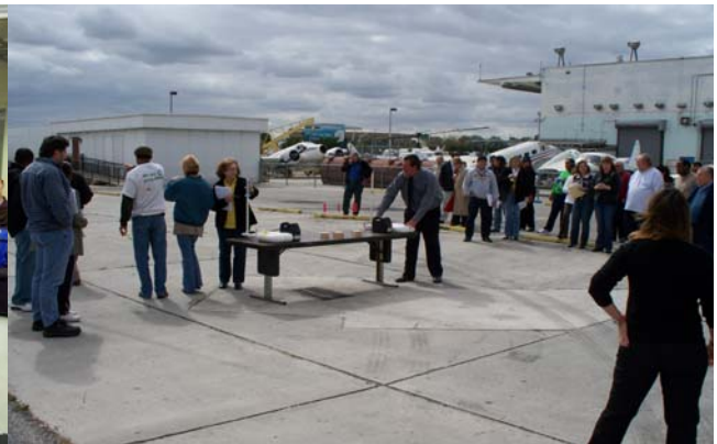
5-4-3-2-1- Launch!!!! All the teachers got a chance to launch!